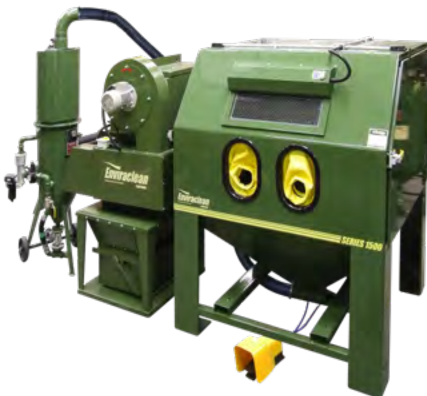
Pressure Cabinet; Dust Collector; Regrader & Blast Machine

Pressure feed machines are commonly used in high production environments or on applications such as alloy wheel refurbishment and cleaning heavy castings.